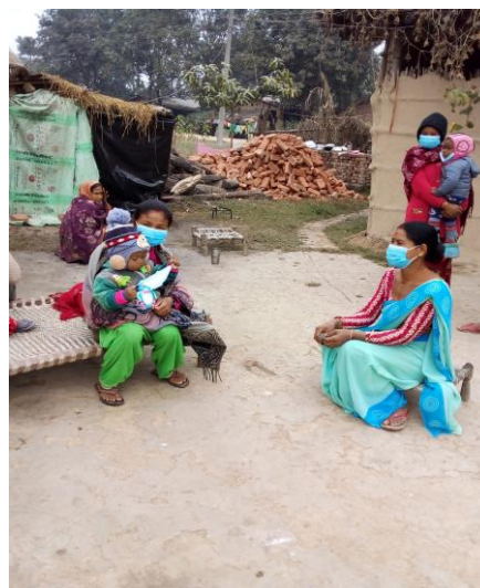
Pic: FCHV mobilized for awareness raising on vaccine misconception.

Seven health facilities (2 from Tikapur and 5 from Bhajani) received medical supplies and safety equipment such as surgical gloves, nebulizer masks, safety boxes, examination gloves, oxygen masks, autoclave, nebulizers, oxygen cylinder regulators, and pulse oximeters to ensure the safety of health staff and service clients for the minimization of transmission risks and smooth service delivery at health facilities. 1741 have benefitted from this. In addition to this, one hundred two boxes of masks were provided to Bhajani and Tikapur municipalities during the national mask campaign. Coordinating with local authorities also supported the campaign in busy and public places, to raise awareness about the use of safety measures such as wearing masks, and proper hand washing.