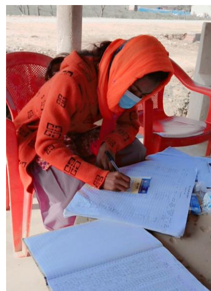
Pic: Volunteer supporting in data management

Awareness messages about COVID-19 safety measures has been aired in the form of radio jingles through two FM stations - Tikapur Samudayik FM of Tikapur and Shivashakti FM of Bhajani. The jingles were aired in two languages, Nepali and Tharu (local language), 12 times in a day for 6 months. Through this intervention, a total of 127,929 people have had access to COVID-19 safety information. Furthermore, the project also supported in the mask campaign of the government by providing masks to the local government for distribution to the public. As different study and RGA showed that the GBV cases were high during COVID-19, therefore a 16-day GBV campaign was also celebrated