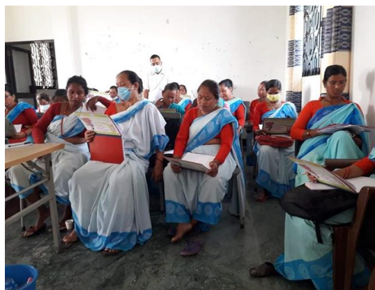
Fig: FCHV orientation on COVID-19 safety measures and vaccination

a) A one-day municipal level immunization coordination committee training was organized at Bhajani and Tikapur Municipalities with the participation of the Mayor, Vice Mayor, ward chairpersons, health staff, health professionals, Disaster Risk Reduction (DRR) focal persons, school management committee member and media persons. In total 51 participants attended the training, of which 10 were female and 41 were male. The content of the training included the situation and context of COVID-19, its signs and symptoms, beneficiaries of the COVID-19 vaccination program, minor side effect of vaccination, AEFI (Adverse Event following immunization), vaccination rumors, and frequently ask questions about the COVID-19 vaccination program. Providing training to the local level immunization coordination committee on the COVID-19 vaccination program helped to activate and mobilize them actively during the vaccination campaign.