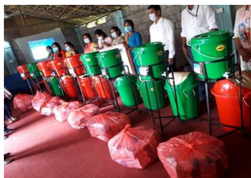
Pic: Materials supported at vaccination sites

Summary: 53 health worker from two municipalities are capacitated on COVID-19 contract tracing and referral services. 208 Female Community Health Volunteers have also gained knowledge on contact tracing methods. The trainings to FCHVs and health workers on COVID-19 has resulted in improved knowledge and skills of local health service providers in the project areas. The support of medical supplies and sanitation accessories has further supported to equip local health facilities for better hospital level care facilities. Volunteer mobilization for data management of COVID-19 cases also supported in triage of the cases as per the severity and seriousness. The delivery of quality of service has improved at vaccine sites and health facilities with these support, as highlighted by the survey findings. Through software, as well as hardware support, the project has contributed to improve the local health system.